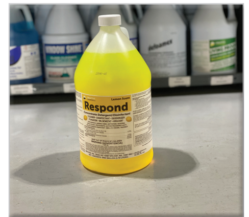
RESPOND & DBK DISINFECTANT