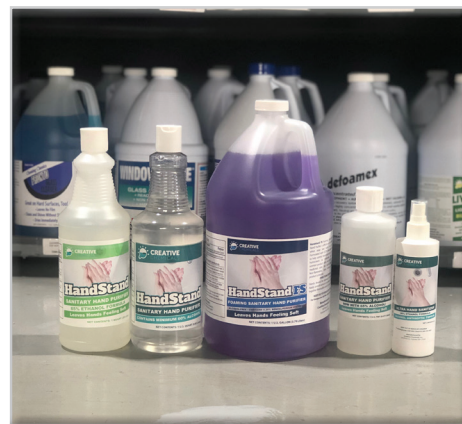
ALCOHOL/NON-ALCOHOL FOAM HAND SANITIZER 4X1 GAL/CASE - stands & dispensers available • 8oz liquid spray pump bottles - 80% alcohol • 16 & 32oz flip top gel bottles - 70% alcohol