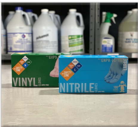
NITRILE & VINYL GLOVES *limited supply