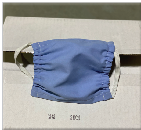
BIOSMART™ REUSABLE FACE MASKS