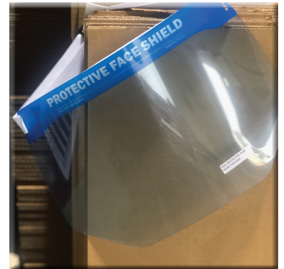
PERSONAL USE HARD FACE SHIELD