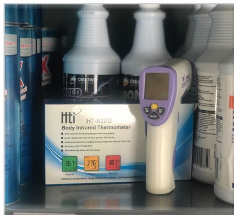
NON-CONTACT INFRARED THERMOMETER