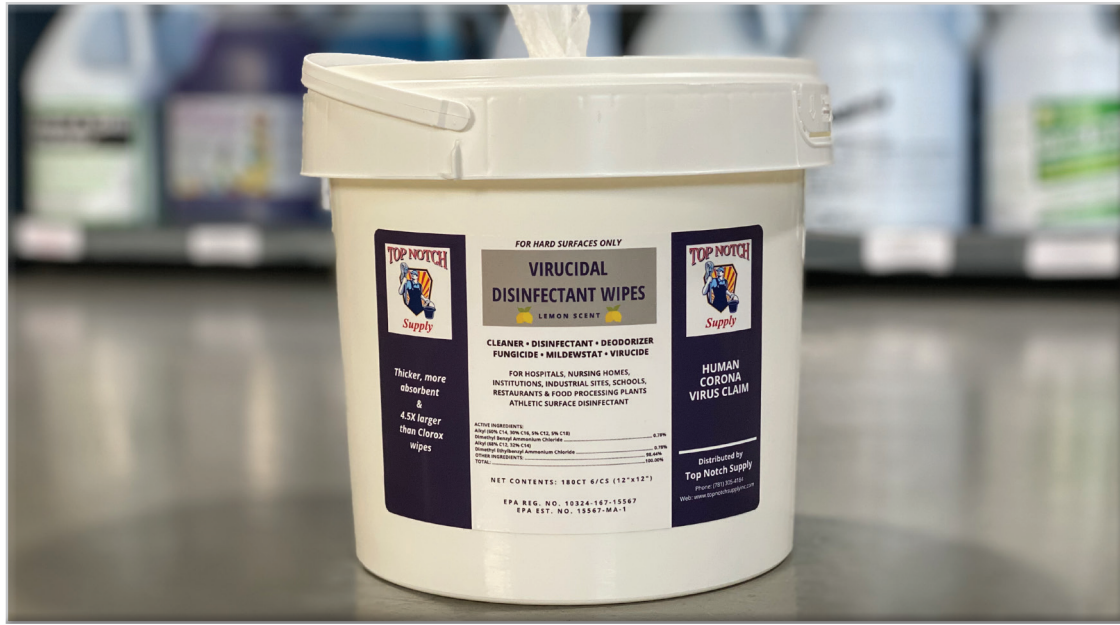
VIRUCIDAL DISINFECTANT WIPES