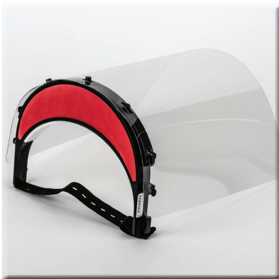
ANTI-FOG WASHABLE FACE SHIELD