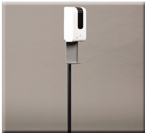
NO TOUCH AUTOMATED HAND SANITIZER STAND