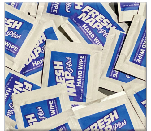
FRESH NAP PLUS